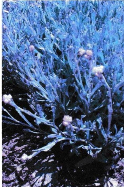
Chrysocephalum apiculatum – Yellow Buttons Variable perennial to 60 cm chrys Gr: gold, cephale Gr: head, apiculatus L: sharp-pointed apex. ☼

Erect tufted perennial to 60 cm brachys Gr: short, come Gr: hair spathe Gr: blade