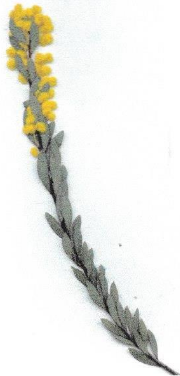
Acacia buxifolia – Box-leaved Wattle Shrub to 4 m akazo Gr. to sharpen Buxus : ancient Box Tree Occurs naturally in ACT but probably planted above Monkman Street ☼