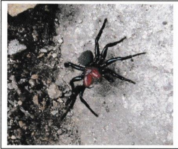
Wolf Spider