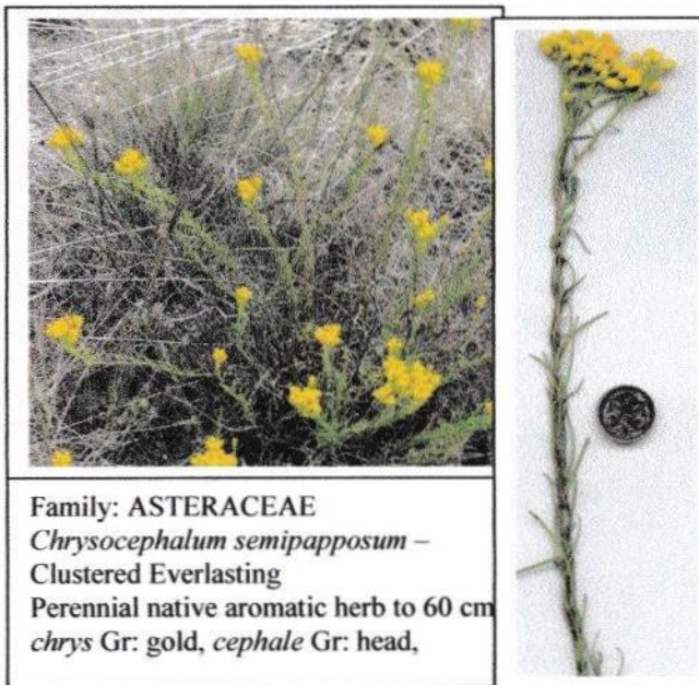
Family: ASTERACEAE Chrysocephalum semipapposum – Clustered Everlasting Perennial native aromatic herb to 60 cm chrys Gr: gold, cephale Gr: head,