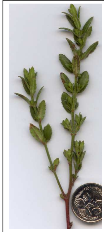
Family: HALORAGACEAE – halos Gr: salt, sea, rhagos : grape berry .