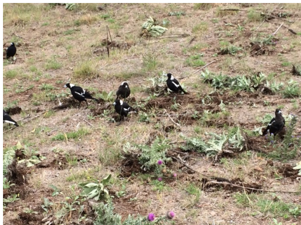
Magpies move in after verbascum is weeded