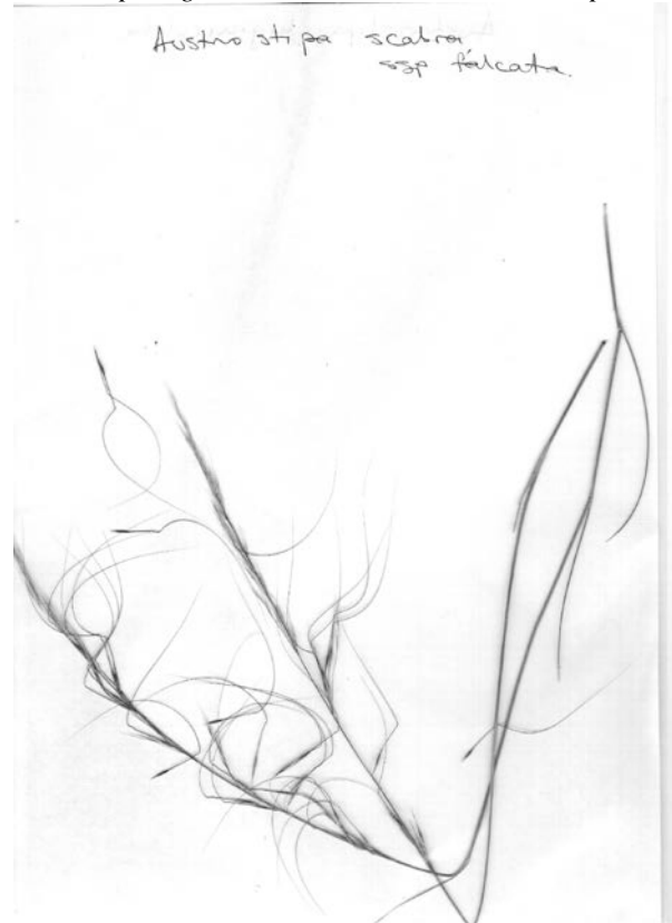
Austrostipa scabra ssp falcata