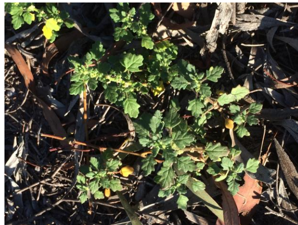
Crumbweed ( Chenopodium pumilio ) now known as Dysphania pumilio

Over the past few weeks I have noticed a small herb growing in many places on the Ridge. I first saw it years ago on the Ridge, and have not seen it since. I knew it as Chenopodium pumilio , but now it is known as Dysphania pumilio . This native aromatic plant has mealy-textured leaves, and grows about 10cm high. It grows in disturbed and bare soils, and can be found in gardens and roadsides. It is now considered an exotic weed in Europe and was probably introduced via Australian wool imports.