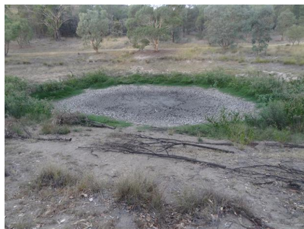
Old Dam 28 February 2019