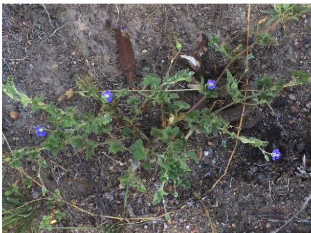
Blue Crowsfoot

This native, Blue Crowsfoot or Erodium crinitum , was located above Monkman St during the February work party. It seems to pop up unexpectedly during some summers. Uncommon but widespread in our area, its leaves, roots and seeds were eaten by the Aborigines. It is easily distinguished from the exotic version as it is the only one with blue flowers. The exotic ones have pink flowers.