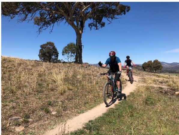
Shimano Challenge cyclists

These cyclists were taking part in the Shimano Challenge from Stromlo along Coleman Ridge to Kambah Pool and back. They had just had a brief stop at the Ceremonial Seat before continuing on their way.