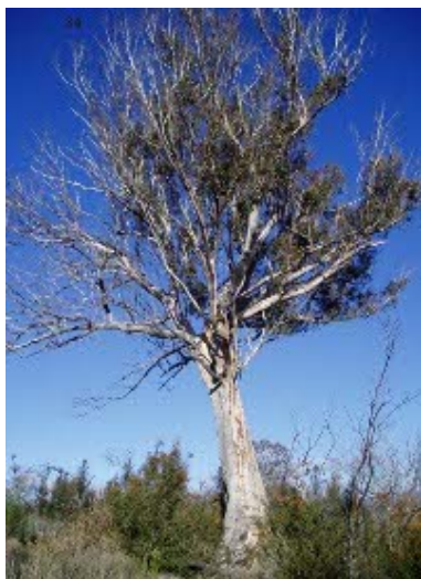
2005 June 24

Over the previous months, Parkcarers had placed weeds into piles as they removed them. Just before the burn-off, the fire crew raked away the weeds heaped along the fence above Fence Post Hill, and scattered them beside the road.