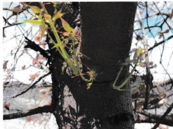
Brachychiton populneum (Kurrajong), producing epicormic shoots. Tree No. 103/1. 300203.