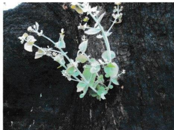
Eucalyptus nortonii (Mealy Bundy), producing epicormic shoots. 300203. The leaves are glaucous: mealy or flowery. ☼