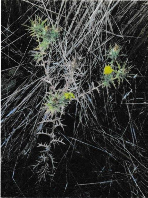
* Carthamus lanatus – Saffron thistle Exotic annual herb to 1m lanatus L: woolly Native of Europe