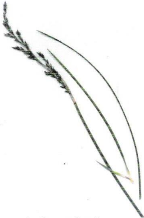
Lepidosperma laterale Tufted native perennial lepis Gr: scale; sperma Gr: seed latus L: broad. ☼

Family CYPERACEAE - cypeiros Gr. name of a sedge.