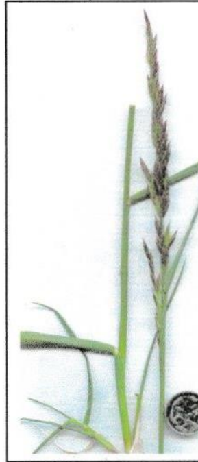
* Festuca elatior – Tall Fescue Exotic tufted perennial to 1.2 m festuca L. stalk, straw; elatior taller (taller than usual in genus) Native of Europe ☼