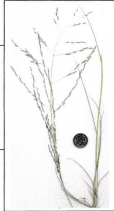
* Eragrostis pilosa – Soft Lovegrass Tufted exotic annual to 0.6 m high; nodes sometimes subtended by a ring of glands eros Gr: love agrostis Gr: grass pilosus L: hairy