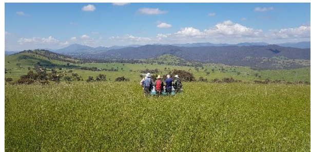
Walkers at the Map Board