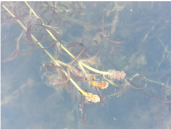
Pondweed (Potamogeton ochreatus)

Potamogeton commences growing vigorously in September, reaching maturity in early summer, when it rapidly disintegrates, or is destroyed by aquatic insects. A second burst of growth can occur in autumn. It occurs erratically and is not a long-lasting perennial plant.