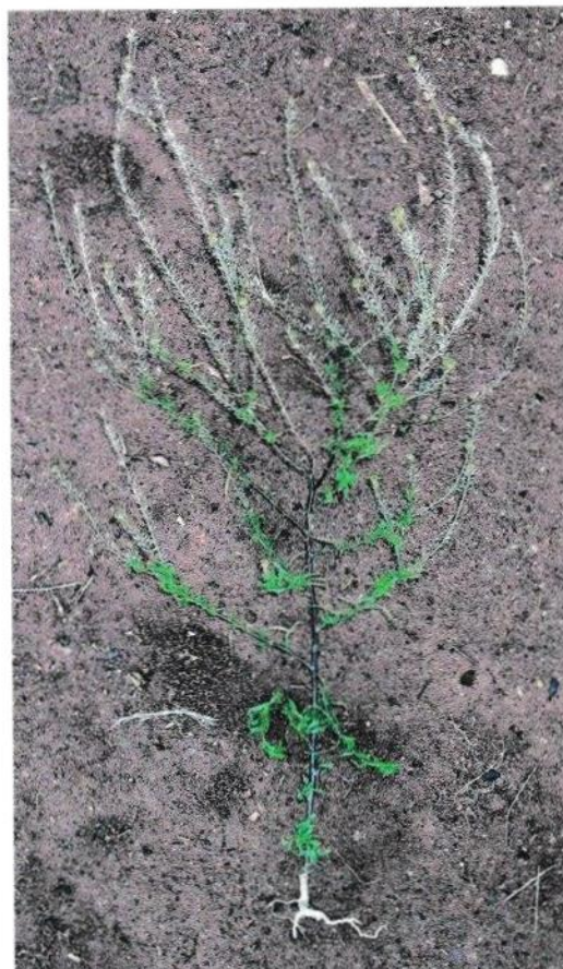
* Lepidium africanum – Peppergrass Exotic annual or perennial herb to 70cm Native of Africa ☼