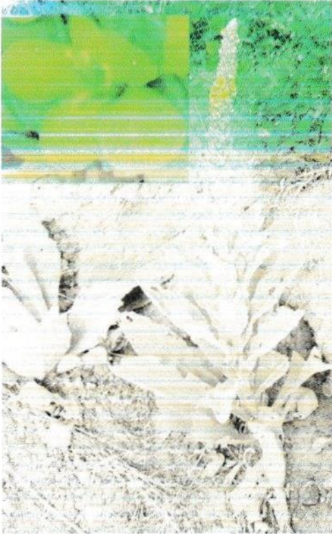
* Verbasum thapsus - Aaron's Rod Erect biennial, 0.5-1 m Native of Eurasia ☼

Family SCROPHULARIACEAE – named from use in treatment of scrophula. The Figwort family which includes Digitalis