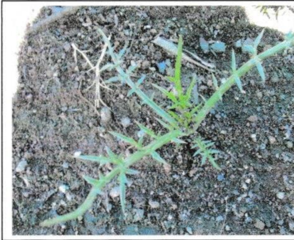
Eryngium ovinum [rostratum] – Blue Devil Stiffly erect annual or short-lived native perennial rostratum L: beaked (bracts) ☼

Family APIACEAE – apium L. celery. Previously Umbelliferae: the parsley family